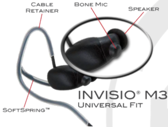
INVISIO® M3 UNIVERSAL FIT